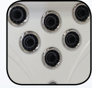
High Volume Swim Jets