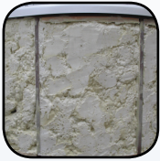
Energy Efficient Full Foam