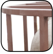
100% 6 Gauge Steel Frame