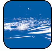
UltraPURE Water Management